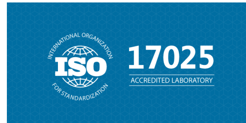
Mass, Force and Weighing